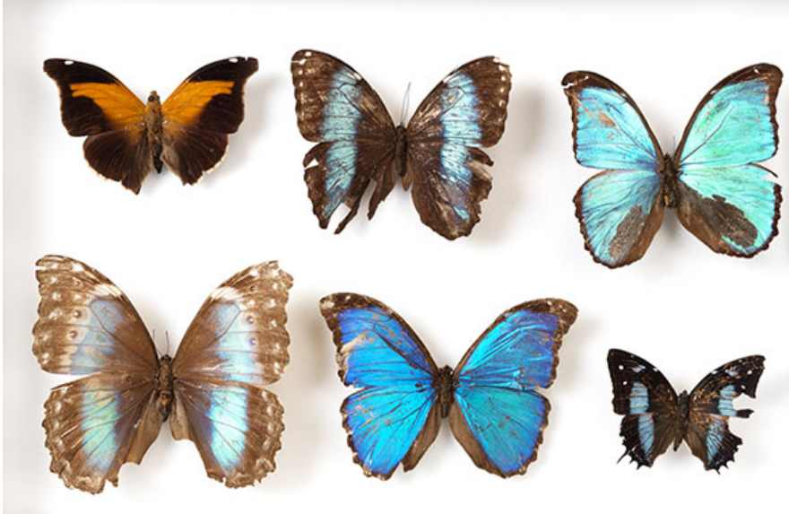
Butterflies collected by Roger Casement, which he donated to the National Museum of Ireland.

An excerpt of Rebecca Solnit's – "The Butterfly Collector"