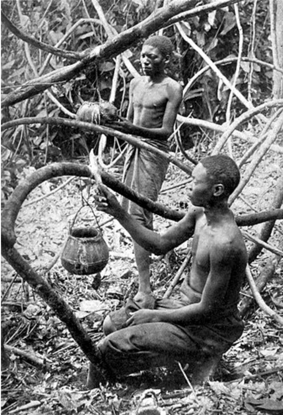
Congolese labourers tapping rubber.