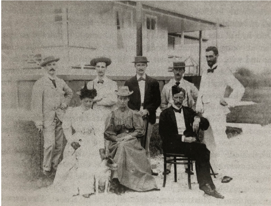
Mary Kingsley seated on the left with Casement's bulldog Patsie, Roger Casement standing on the very right, Africa, 1895

Mary Kingsley: "[...] what I am really after is fetish."